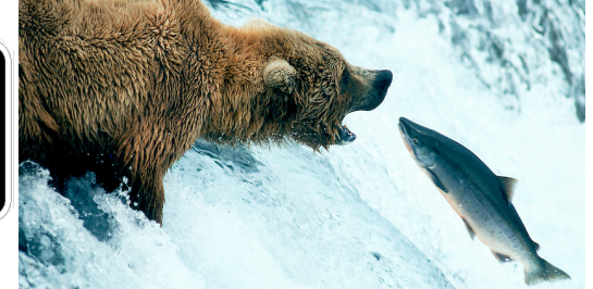
Page 2 of 4